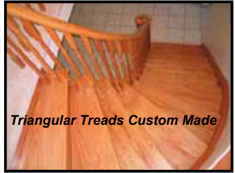
Triangular Treads Custom Made